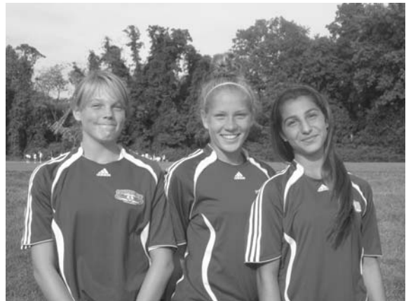
Concord Soccer U14 Girls Selected for Olympic Development Team