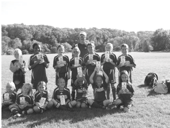
U9 Soccer Sisters